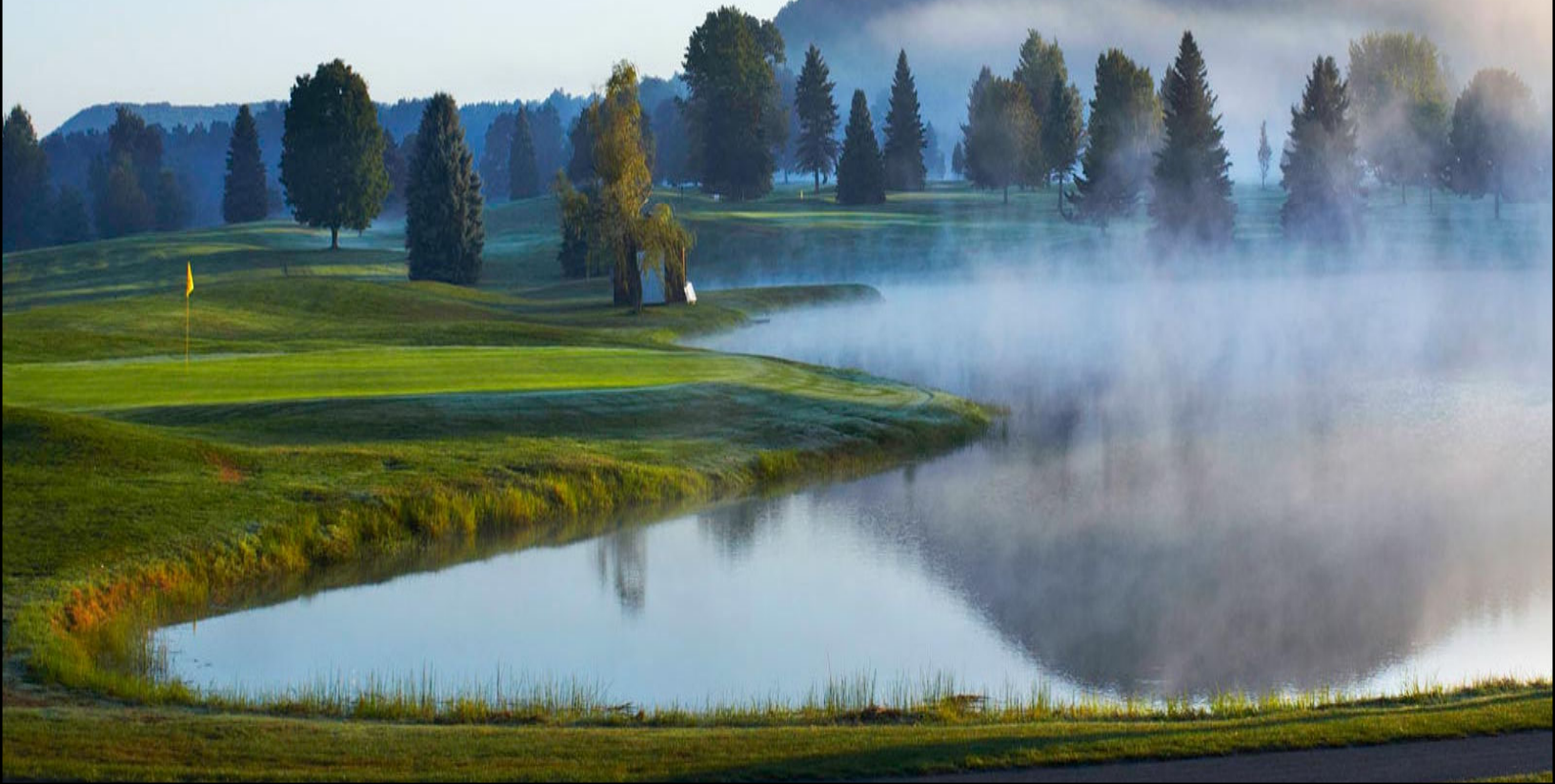
A beautiful view of #12 at Cable Hollow Golf Course, Russell, PA

A publication of the Northwestern Pennsylvania Golf Course Superintendents Association, Inc. Volume 19, Issue 2 - June 2016