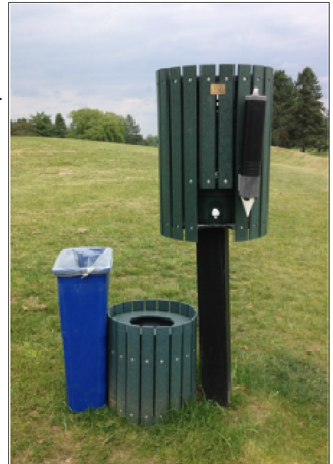
What is wrong with this picture?

The biggest takeaway from my initial assessment has to do with the number and location of receptacles on the