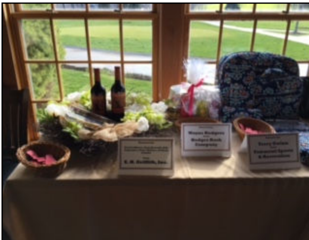
Just a few of the bountiful door prizes supplied by our commercial members at our March 20th Ladies Day Party at Venango Valley Inn & GC.